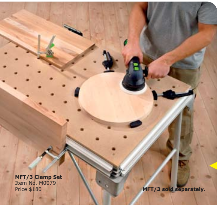
MFT/3 Clamp Set Item No. M0079 Price $180