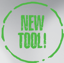
MFK 700 – Basic Item No. 574 419 Price $400