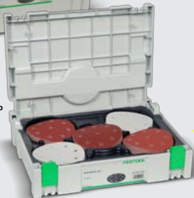
5" Abrasive Promo Item No. M0077 Price $150