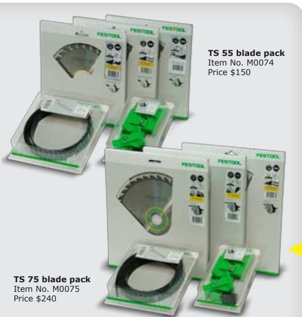
TS 55 blade pack Item No. M0074 Price $150