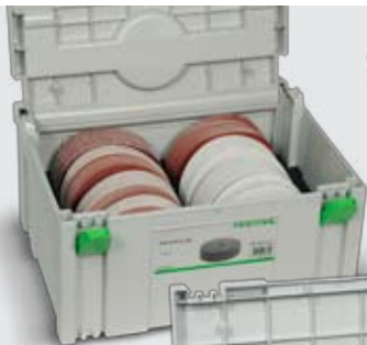
6" Abrasive Promo Item No. M0078 Price $215